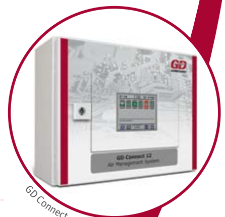
GD Connect 12